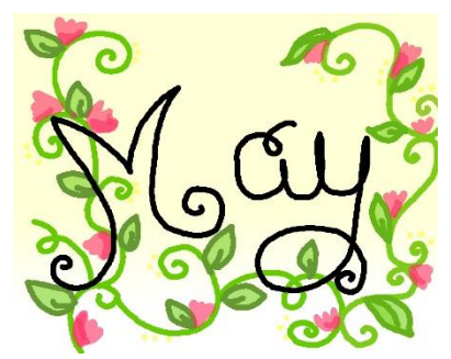
Welcome to our May Newsletter.

Term 3 is an extremely busy month in school…we are certainly not winding down. We have First Communion, sports days, our summer fair, reports etc so it's a very exciting time.